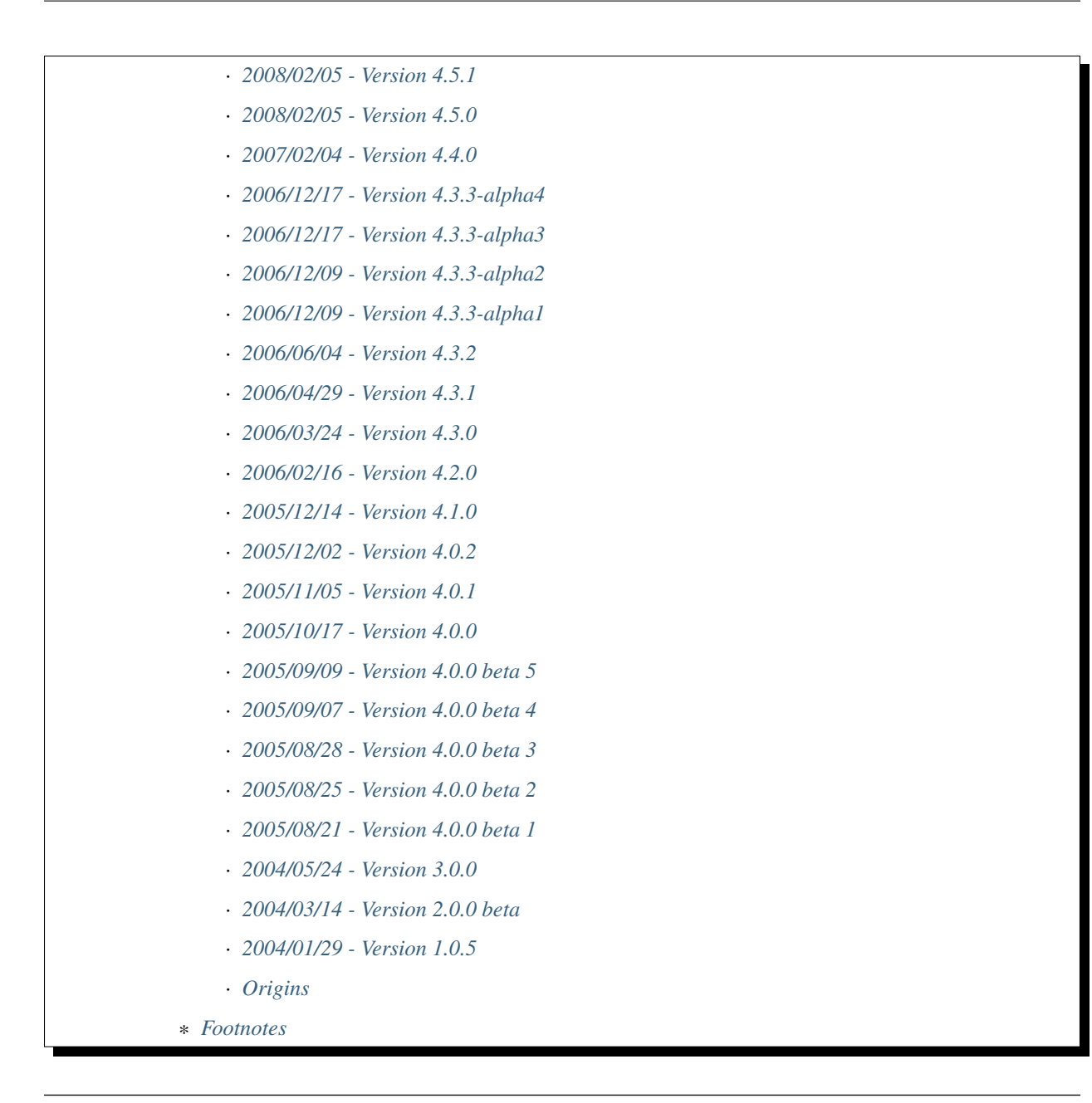
Note: The best introduction to working with ConfigObj, including the powerful configuration validation system, is the article: